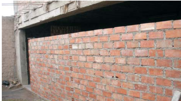
Outside wall of the VTC . Photo taken in July, the windows are now in.