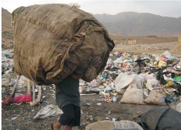
This photo taken by Hector in 2008 of a child working in the dump, motivated us to do something. A month later the feeding center started.