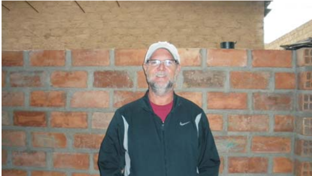
Standing inside the future Vocational Training Center

Recently, we were approached by one of our ministry partners with an offer for a matching grant towards the completion of the Vocational Training Center we are building in Lomas de Carabayllo in Lima, Peru. We've never been offered a matching grant before, but we see it as an opportunity and a blessing from God. I want to share this opportunity with you and welcome your involvement with it, if God touches your heart.