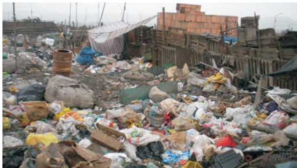
The view from behind the center where people sort through trash & recycle.

The matching grant offer is for $3,500, which, if met, would give us a total of $7,000. This should be enough to finish the construction and move us closer to opening our first training module on carpentry. The list below outlines what we'll do with the grant funding if we are able to obtain it: