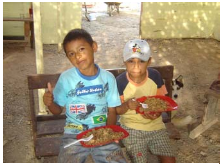
Kids enjoying a meal at the Valle Verde Feeding Center