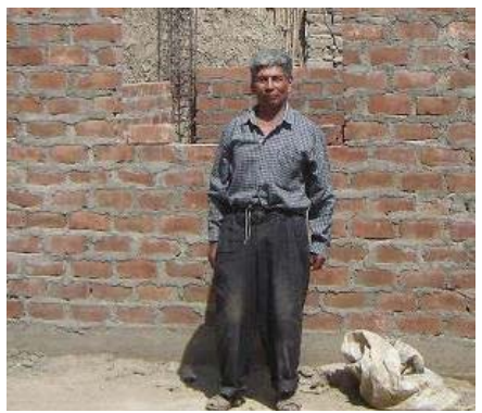
Another earthquake relief house going up in Pisco