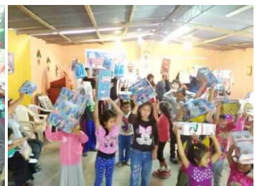
Lomas de Carabayllo

On another note, two of the churches in Peru gave donations to help the ministry in SE Asia. The funds they gave will support two of the indigenous missionaries that we support in Laos and Myanmar for a full month. Also, they continue to send mission teams out to other parts of Peru. Gloria a Dios!